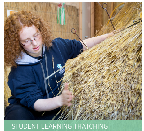
STUDENT LEARNING THATCHING